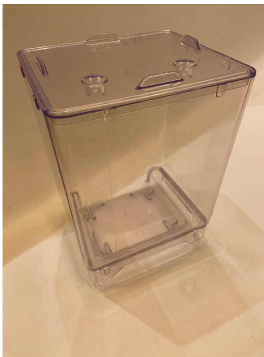
Milk container PM 4.5